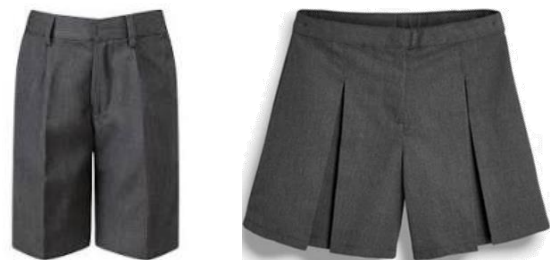
Smart tailored shorts or skorts (grey or black)

Children should wear black, low heeled shoes for school; not boots, sandals or trainers. Trainers can only be worn on PE days.