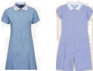
Blue and white checked summer dress

Now that the sun has finally appeared... children can wear summer uniform:-