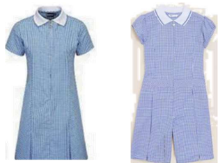
Blue and white checked summer dress