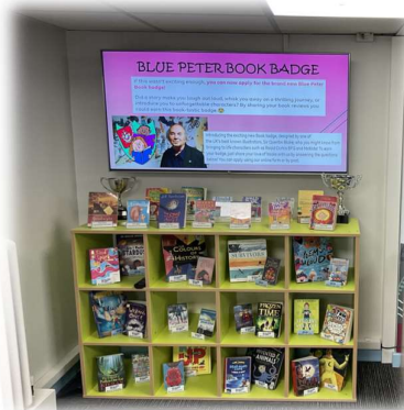
New display screen