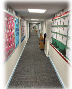
Replacement corridor carpet